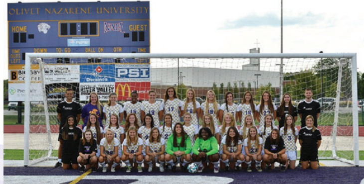
2017 CCAC Championship Team

6 NAIA National Tournament Appearances 1 NAIA National Runners up 2012 5 NCCAA National Tournament Appearances 1 NCCAA National Championship 2008 1 NCCAA National Runners up 2009 20 NAIA and NCCAA All Americans 6 Regular Season CCAC Championships 6 Conference Tournament Championships 79 All Conference players 78 NAIA Scholar Athletes NAIA Top 25 7 consecutive years Coach Bahr 6th in NAIA for All Time Winningest Active Coaches 263 wins 128 losses 29 ties .666 winning percentage